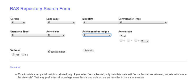
Figure 3: The repository's search form.

as a zipped archive. The back-end of this search engine is implemented as an SQLite database which is also used by the SRU endpoint (BAS, 2015) for federated content search (CLARIN, 2016a). The latter allows users to search CLARIN corpora world-wide across different centers. The search engine's front-end and an example search result are shown in Figures 3 and 4, respectively.