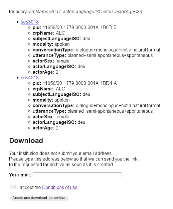
Figure 4: Result of a cross-corpora search.