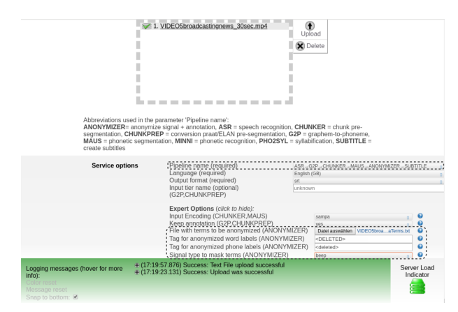
Figure 3: BAS web interface for the pipeline service using the 'Anonymizer' service together with selected options.

As with the 'Subtitle' service, the 'Anonymizer' is most likely applied within a pipeline. We therefore demonstrate the usage of this service in a pipeline that anonymizes the subtitle track of Section 2: 'ASR_G2P_CHUNKER_MAUS_ANONYMIZER_SUBTITLE'. Fig. 3 shows the pipeline web interface with the selected pipeline and the selected options for the 'Anonymizer' module.