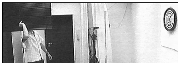
(b) Group 2: Vision of body