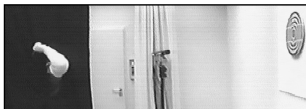
(c) Group 3: Vision of arm