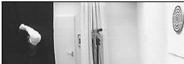
(c) Group 3: Vision of arm