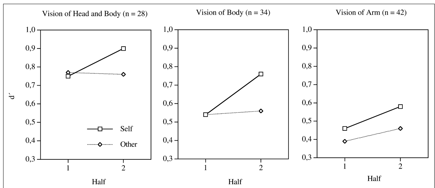
Fig. 2. Accuracy of prediction for self- and other-generated action during the first and the second half of trials. Results are shown separately for the three experimental groups.

Observing throwing actions allowed the participants to predict a dart's landing position. Predictions were more accurate when the head and eyes of the acting person were visible in addition to his or her body and arm. This result supports the assumption that one's own attention can be coupled with that of another person (Adamson & Bake-