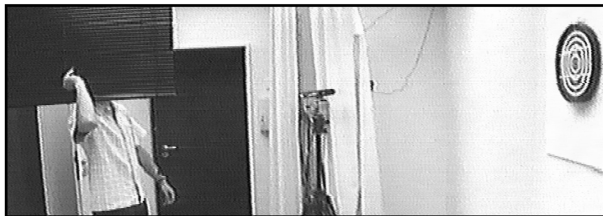
(b) Group 2: Vision of body